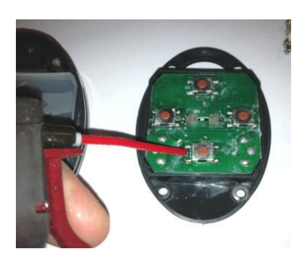
Mount switch board and rubber keyboard