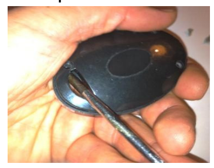
Battery on the back side